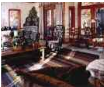
The Big Rug - 15'x18'