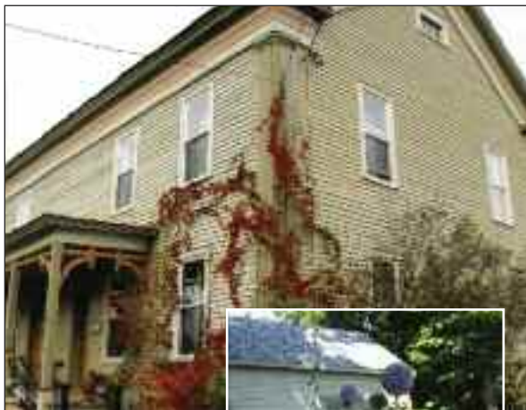
Scenic Landscapes & Garden