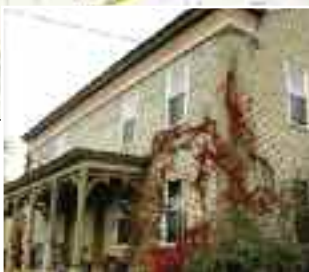
The Historic Grange In Parishville