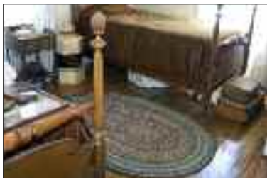
Accomodations and Meals Included.

Students will learn the steps in making a round, oval, and square rug. The weekend price is all inclusive: twelve hours of lessons, a kit for a 2' x 4' rug of your choice, needle, twine, clamp, instruction booklet, sleeping accommodations, meals, & beverages.